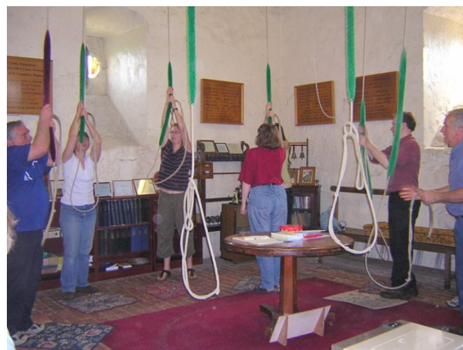
Shipbourne and friends at Lydd.

O n a glorious Saturday in May eighteen people, six cars and two dogs set off on the Shipbourne Tower Outing, which was conceived from a recent newspaper article describing churches of Romney Marsh. There were fifteen bell ringers, a cosmopolitan band consisting of seven Shipbourne stalwarts aided and abetted by friends from Tonbridge [8, 19-1-0 in E b ], Leigh [6, 8-2-0 in A] and Penshurst [8, 17-2-11 in E b ] towers.