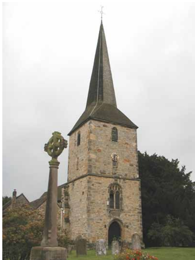
The Parish Church of St Peter's Hever, previously the seat of the Bullen / Boelyn family.

The Tonbridge district met at Hever at 3:00 pm on Saturday 5 th April. The ringing ranged from call changes, Grandsire , St Simon's and Stedman , to courses of London Surprise and Norwich Surprise and a touch of Cambridge .