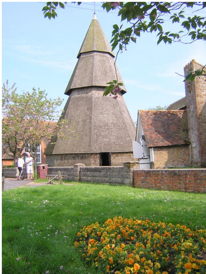
The unusual campanile at Brookland.