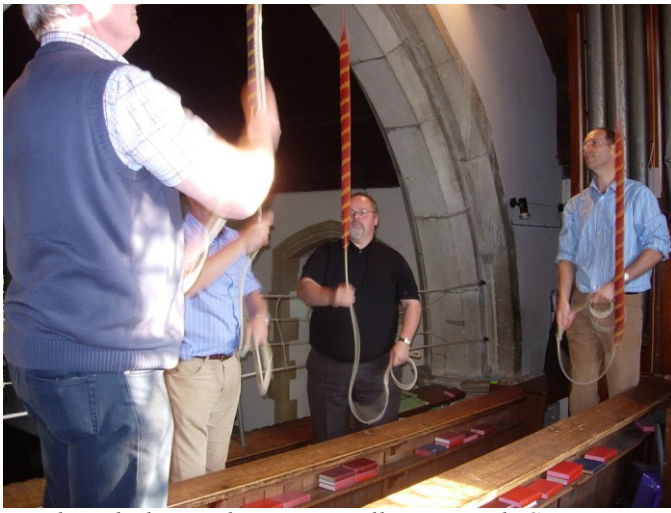
Neatly tucked in on the ringing gallery at Leigh, Surrey.

Then off to Leigh St Bartholomew [6, 7-2-20 in A]. Sounds like a nice light easy ring – not so when you are balancing on a combination of choir stalls and wooden boxes. Thankfully there was something resembling a badminton net to break your fall should you unbalance and topple into the church way below!