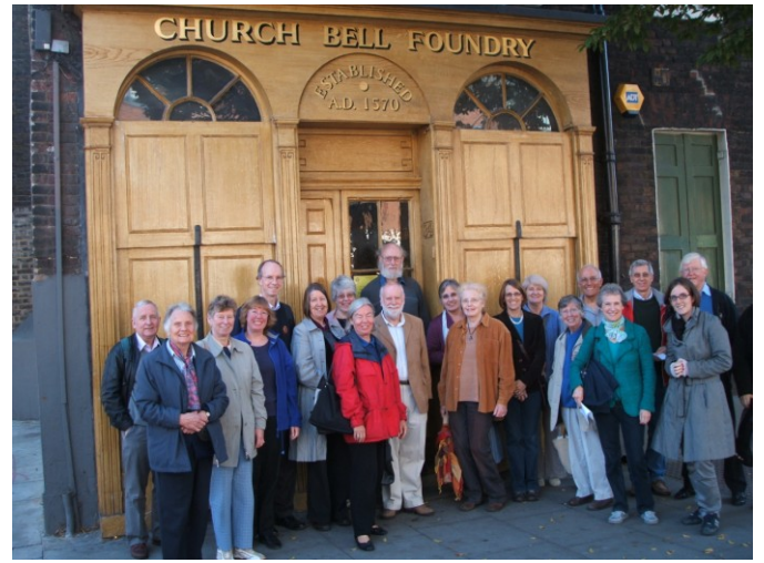
Otford and taggers-on at Whitechapel.

On 9 th October the Otford Guild of Bellringers set out on their annual outing. We had arranged to visit the Whitechapel Bellfounders and then investigate the bells at two of the City churches. We congregated at Otford station full of anticipation to find signs up stating that there were no trains to London. However, while we were discussing if we had enough cars to get the party to Sevenoaks, a train came in from the Maidstone area. This then reversed towards Sevenoaks, and we were on our way. Apart from a slight difference of opinion as to which exit to use at Whitechapel tube station we all arrived safely. I think we were all surprised to see the old fashioned shop front set among modern developments, and delighted to see the unchanged aspect of the interior.