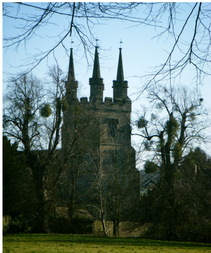
St John the Baptist, from the parkland of Penshurst Place.