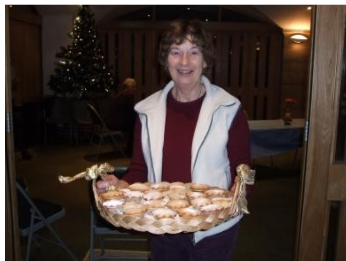
Mince pies and mulled wine, and promises were kept.

The event was considered a great success and the undercroft at St Nicholas was a most suitable facility for the event.