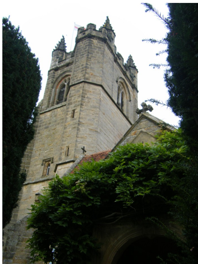
The tower of St Mary's Chiddingstone can be seen from some distance away to the North, from across the Eden Valley.

The afternoon meeting was held on a beautiful day – a late start due to wedding photographs. An hour's mixed ringing ended in the service touch of Grandsire Triples . The evening ringing was more advanced methods but equally well attended with two or three visitors from outside the district.