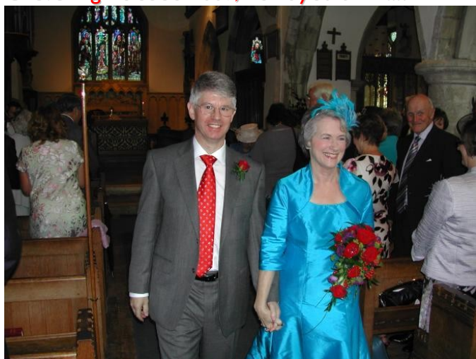
The bride and groom walk down the aisle after the service.