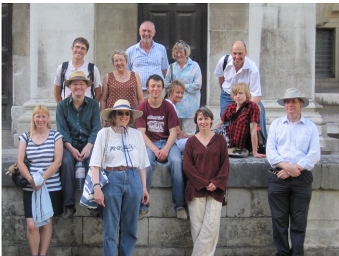
The official photograph, albeit after losing ringers from Kemsing and Tonbridge.

To reach Island Gardens necessitates a change at Canary Wharf for the 8 at Christ Church on the Isle of Dogs [8, 10-3-27 in F # ] where, after ringing some Cambridge the Hadlow ringers went off to a party. Those who had not been invited welcomed the cool walk through the tunnel to Greenwich, but our joy was short-lived because the lift was out of order and we had to climb 100 steps.