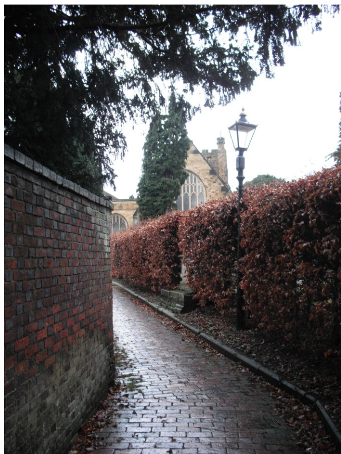
The Parish Church of Sts Peter and Paul, Tonbridge.