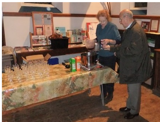
The since customary mulled wine and mince pies were thankfully received.