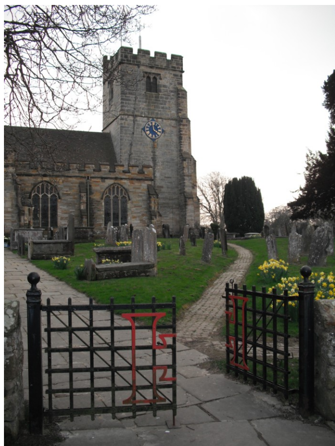
Now in the throes of spring, St Laurence Hawkhurst.