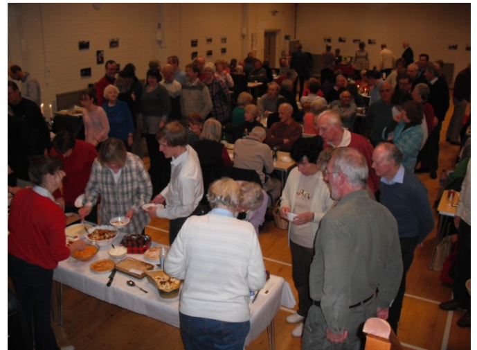
An overview of the situation as dessert is served.

The rounds included a "Bell" round, without a trace of the campanological in sight, followed by a round of "Misnomers", including a mention of the Canary Islands, which are named after the Latin canis . In a round of "Clocks" it emerged that the largest clock face in the UK is to be found on the Liver Building in Liverpool, and "Arch(ange)ology" (a desperate attempt to name the theological study of angels) turned out to be fairly close to "Angelology" in the "Angels" round! After all that a break was certainly needed for food.