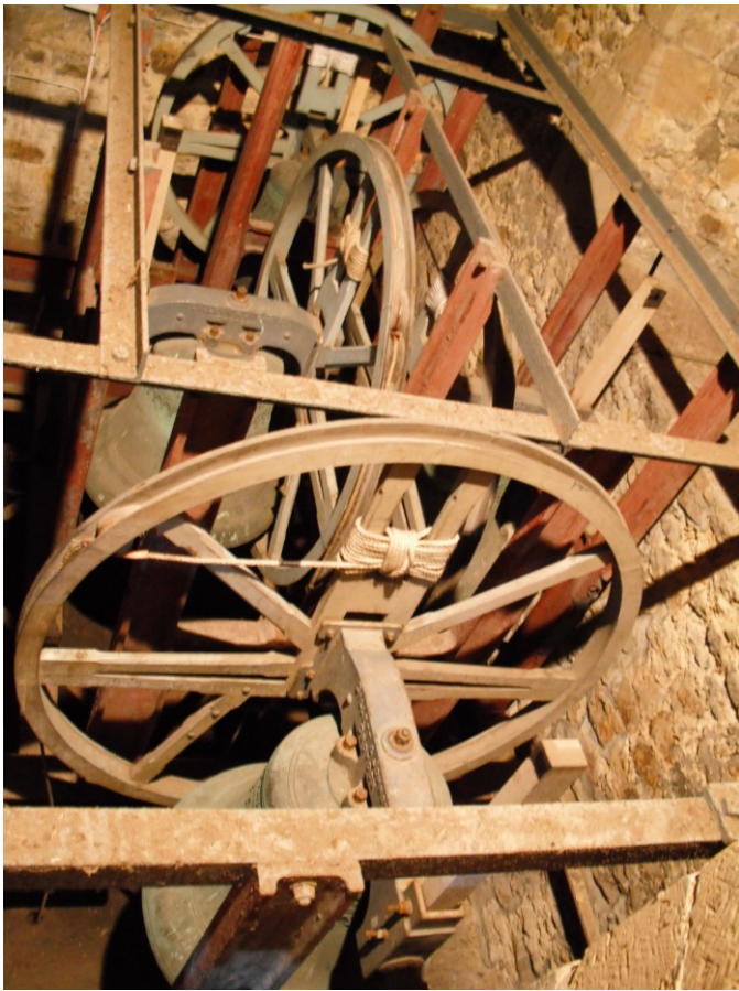
A view of the south side of the belfry, showing, furthest, the third, the fifth and the fourth, and the sixth nearest to the camera.

The ring that Gillett and Johnston cast is as follows: