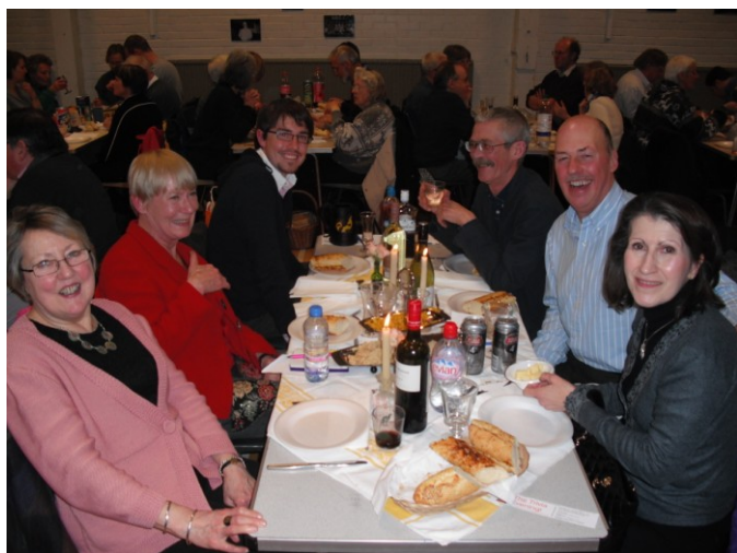
... and also commiserations to Penshurst!