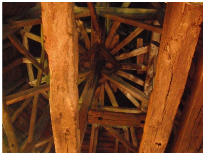
An inspiring (!) view up into the timbers of the tower roof.

page of the first Edition will reveal an advert by the Croydon founder Gillett and Johnston presenting some of the current commissions the foundry was working on. The first edition mentions the Gillett and Johnston ring at Tunbridge Wells [where a "Ringing World Peal" has been rung, see peals] and in the advertisement Edenbridge is also listed.