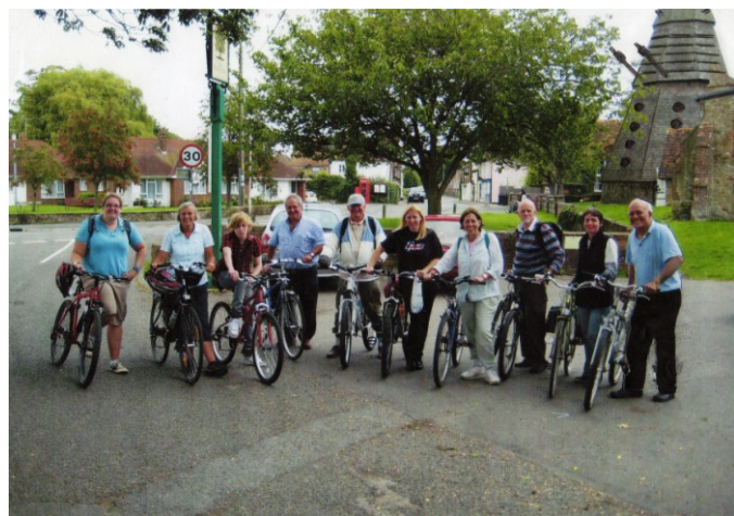
An outing party, reputed to come from the Tonbridge District, but possibly also from much, much, much further afield.