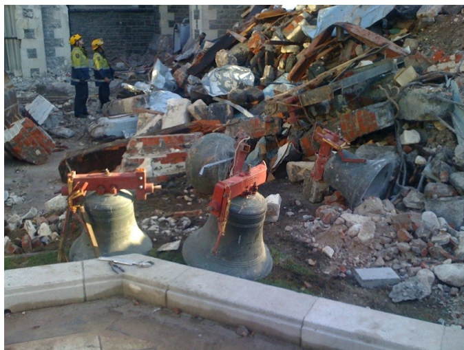
Four of the bells survived their fall, seemingly intact.