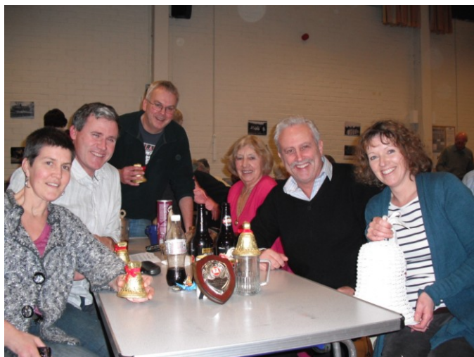
Congratulations to Penshurst...

seawater, leading to the formation of elemental chlorine, had in the past been responsible for poisoning German submarine men. The “Missing” round was not quite so fiendish, with such questions as “which Teletubbie is not in this list: Tinky-Winky, La-La, Po” being more on our level! As far as we know, no-one started singing the theme-tune.