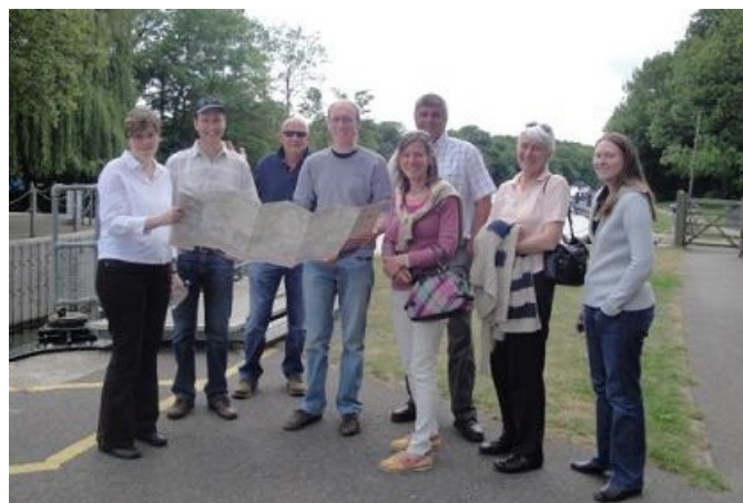
The official photograph – but not a bell tower in sight. Perhaps it's why we are consulting the map.