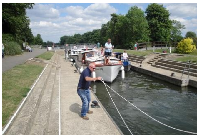
"Look to, she's going..."

After not ringing at Dorney, we continued to Old Windsor [8, 11-1-21 in G]. Some of us had got it into our heads that this was actually a six, with an even greater private moment of confusion when the first count produced a total of seven ropes. Fortunately there we had some more open-minded and mathematically able individuals with us, who could also read the itinerary. The long draught at Dorney was slightly disconcerting until we got used to it. We were told that the rope guides had been removed in order not to pander to ringers with poor handling.