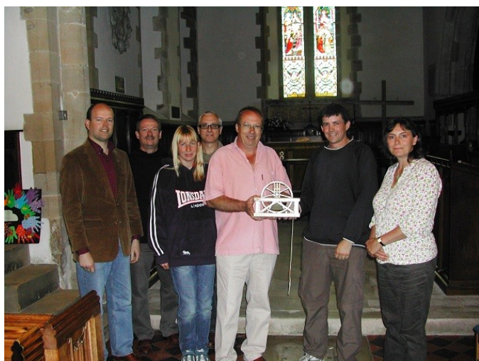
The method-ringing competition trophy is presented to Hadlow.

The method competition had three entrants, Sevenoaks 3 rd (74 %), Tonbridge 2 nd (83 %) and Hadlow 1 st (89 %).