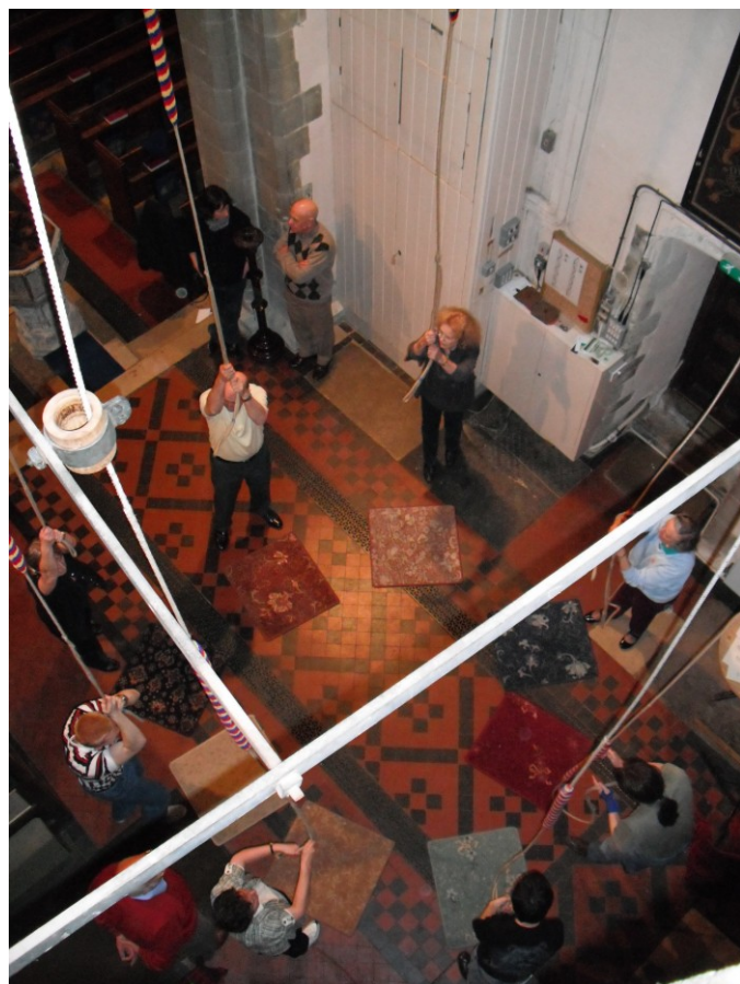
The view from above: Taken from the top of the distinctive, open anti-clockwise turning "lady stair" in the north-west corner of the tower.

The second quarterly meeting of the Tonbridge District took place at Westerham [8, 23-0-17 in E b , GF] on Saturday 2 nd April 2011. Ringing commenced at 3:00 pm, with Heathcote and Lynch, ringing masters by appointment to the Tonbridge District, in charge.