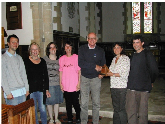
The call change trophy is presented to the band representing Lamberhurst by the judges, on the right.

The District striking competition took place at Leigh [6, 8-2-0 in A] on 7 th May 2011 when seven teams took part. Once again this year we had the rather novel idea of mixing the call change bands with the method people.