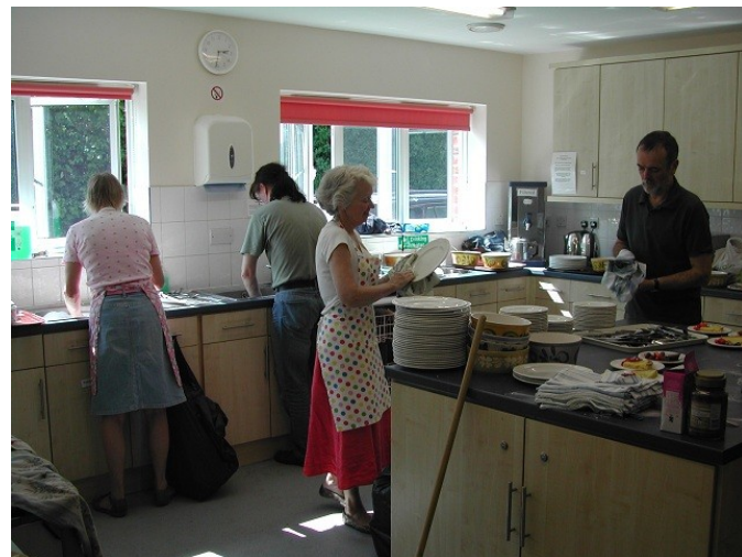
In one way or another, all hands on deck in the Tonbridge District.

All officers were re-elected for a further term. Four members received 50-year membership certificates.