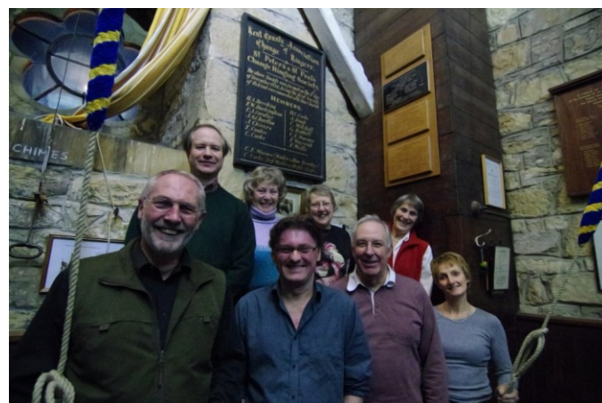
The 125 touch band.