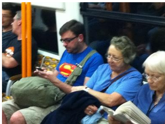
This image was sent last summer with a suggested caption, which the Editor has since lost.

F or those of us who had seldom rung on more than 6 bells the whole day was a great experience - for in the group there was a good mixture of skillful ringers and those with less confidence. We heard methods such as Grandsire Caters and Stedman Cinqnes rung magnificently by our accomplished teams and for those who felt less secure ringing on more than 6 bells, there were plenty of opportunities to ring rounds and call changes on the 8, 10 and 12 bell rings.