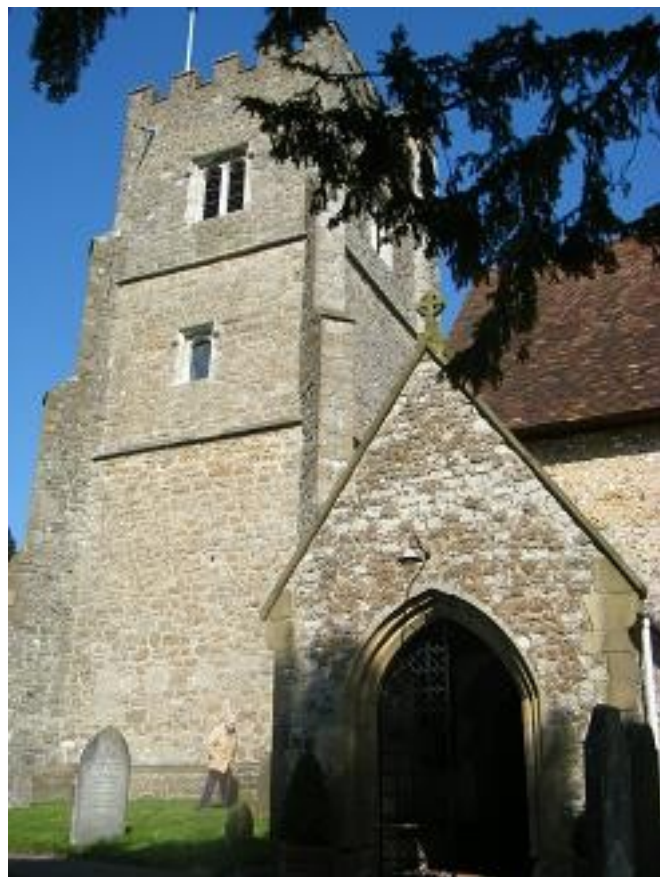
Although clad in scaffolding and sheeting when the ADM took place, this is what Chevening looks like normally!

The Annual District Meeting of the KCACR Tonbridge District was hosted this year by Chevening [8, 10-1-13 in G] on Saturday 1 st October 2011. Ringing commenced at 3:00 pm, of which a very sprightly and lively touch of Plain Bob Major was a highlight.