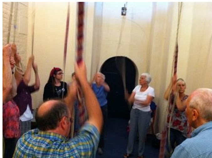
The London outing at St Anne's, Limehouse.

W HAT A GRAND DAY OUT! A group of about 30 people from the Tonbridge and Lewisham Districts met on a rather damp Saturday morning in August outside St James' Church in Bermondsey. In this tower the 8 bells [14-1-15 in F # ] were cast from cannon left behind by Napoleon at Waterloo! A short walk away was St Mary with All Saints, Rotherhithe (another peal of 8 [10-2-5 in A b ]), where the bells had probably rung for the coronation of Queen Elizabeth I. The next two towers each had a 10 bell ring - St Anne's, Limehouse [12-3-25 in E] and St Dunstan's Stepney [28-3-0 in C # ].