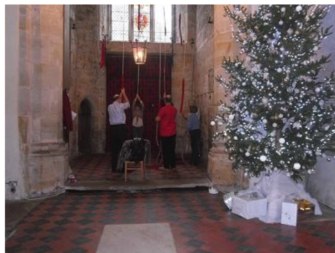
Ringling at Penshurst, as and when filming and Christmas allow.