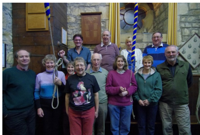
The St Peter and St Paul Change Ringing Society after ringing a quarter peal and a 125 touch to celebrate the 125 th anniversary of their founding.

One of the boards which decorate the Tonbridge [8, 19-1-0 in E] ringing chamber walls commemorates the occasion of the founding of the St. Peter and St. Paul Change Ringing Society . One day a group of 14 gentlemen met and formally set up the Society. 125 years later members of the current St. Peter and St. Paul change ringing society met to celebrate the event.