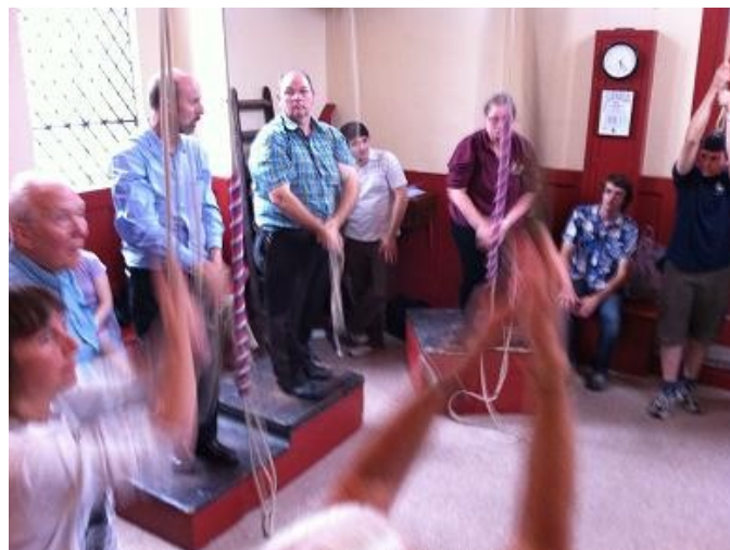
Ringling at Stepney.

W hereas the first 3 churches were largely brick built and quite large, St Dunstan's was reminiscent of many of our own village churches, being far smaller and built from Kentish rag stone. These bells are the ones commemorated in the rhyme Oranges and lemons... 'when will that be, say the bells of Stepney'! After that we travelled on a bus to what we were all waiting for – the 12 recently rehung bells of St Michael, Cornhill [32-1-6 in D b ].