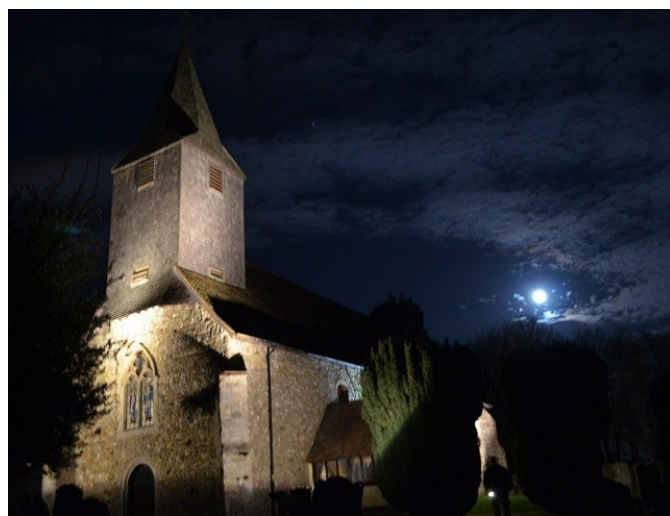
The attractive form of St Mary the Virgin, Kemsing, by flood and moon light.

This year the East Grinstead and District Guild joined the Tonbridge District for the carol service in Kemsing [6, 4-1-5 in D, GF].