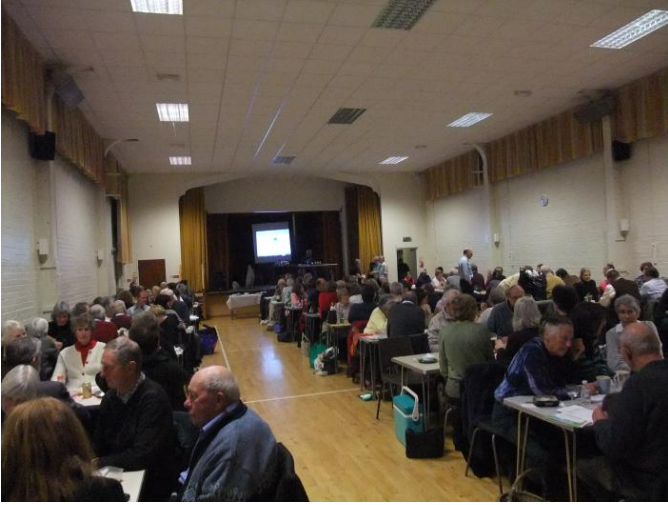
A general view of the scene at Hildenborough Village Hall.