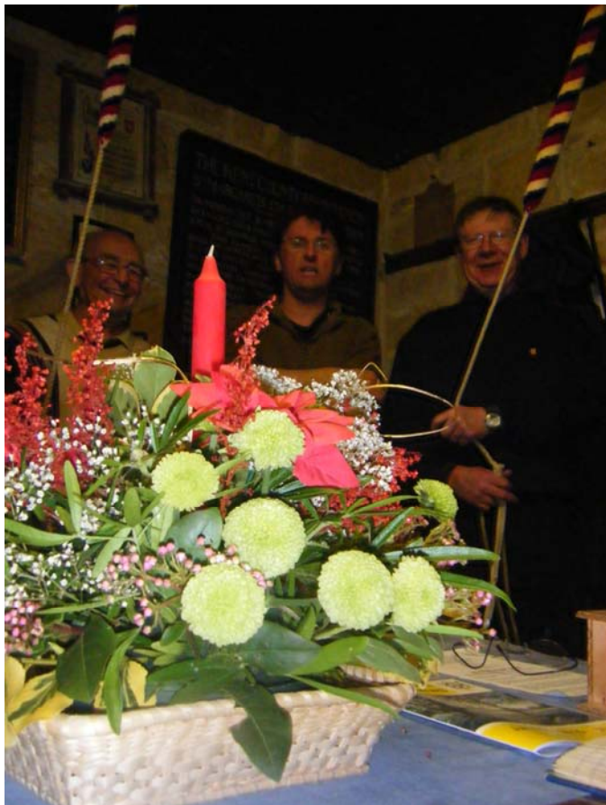
Festive decorations post New Year in the ringing chamber at Horsmonden. And some flowers.

The first meeting of 2010 saw the Tonbridge District slipping and sliding its way through the Kent countryside to St Margaret's Horsmonden [17-2-10 in E b ] on Saturday 2 nd January. Ringing commenced at 3:00 pm and the first session of the afternoon, including a lively course of Yorkshire Surprise Major , culminated in a service touch of Grandsire Triples .