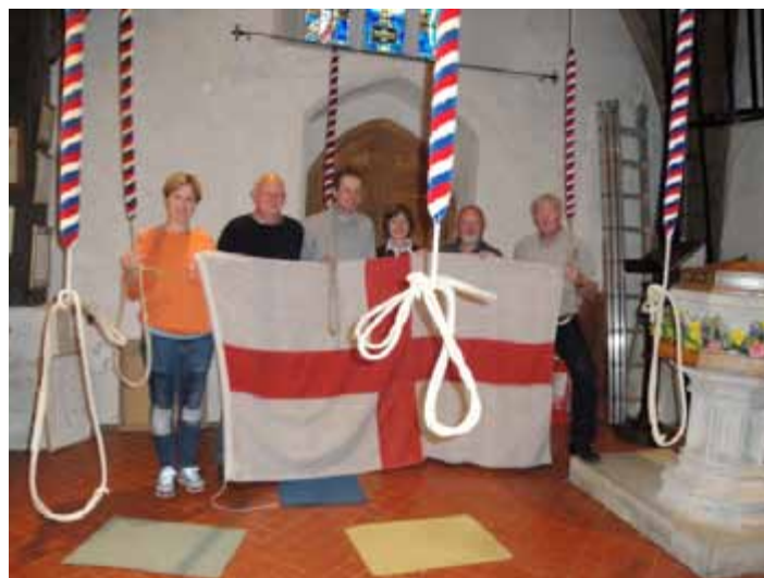
The Cowden band following their Ringing for England on St George's Day.