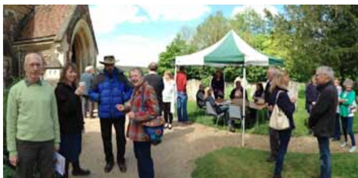
Ringling under way.

But for the Tonbridge method ringing band doom was at hand. They were drawn to ring first – disaster; for it is said that the band to ring first never, ever wins a striking competition. But is this just an Old Wives' Tale?