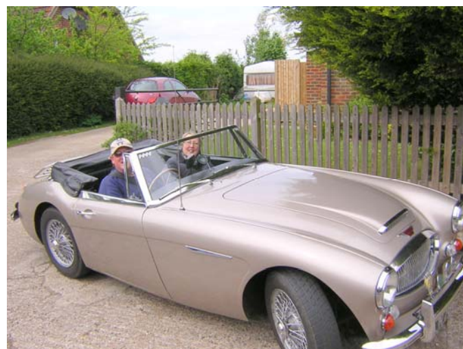
Shipbourne outing's Tonbridge contingent travels in style.

Saturday 9 th May saw members of Shipbourne tower embark upon our second Annual Outing, augmented by our good friends from Leigh and Tonbridge. A band of twenty-two bodies sallied (sorry!) forth... fourteen ringers, a patient young son and two dogs with five Wags. By popular request we revisited Romney Marsh, with an Austin Healey 3000 open-top sports car adding an air of distinction to our fleet.