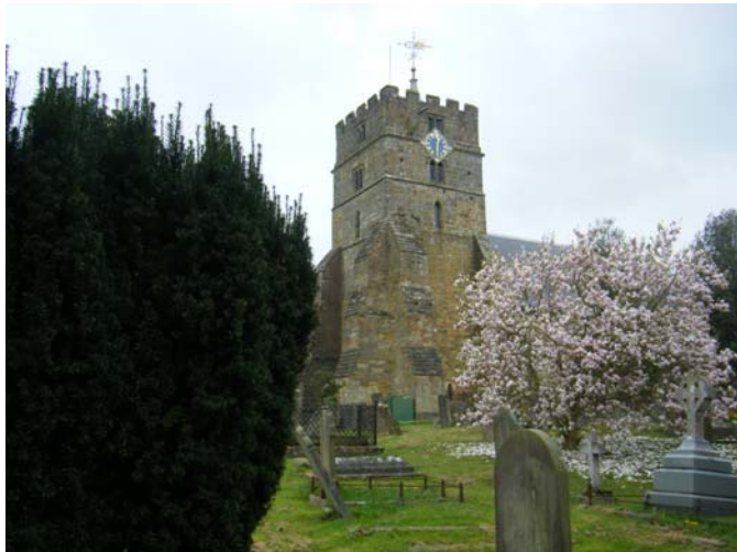
The Churchyard of All Saints, Brenchley.

It was good to see so many people up the tower in the afternoon. At the moment Brenchley bells are not easy to ring well and so the ringing was mostly Call Changes , Grandsire Triples and Plain Hunt on seven, with some Stedman and a service touch of Grandsire Triples . There were fewer people in the evening, when, in addition, we rang some Single Oxford Bob Triples , Oxford Treble Bob , Bob Triples and a course of Cambridge Major .