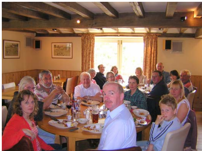
The outing party at lunch!

conjured up hot coffee to sup in style from posh china cups. At All Saints [8, 15-2-7 in F#], known as the ‘Cathedral of the Marsh’, Rounds and Call Changes , Grandsire Doubles and Plain Bob Minor were rung, thus warming up the bells nicely for an afternoon wedding.