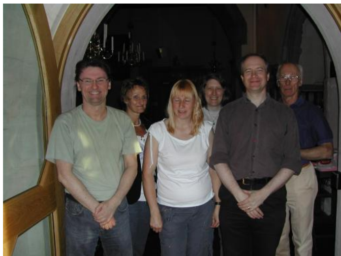
The Tonbridge team that won the method ringing competition.

The chairman proposed a vote of thanks to the judges, the vicar for the use of the bells, and to all others who had worked to make a successful event – especially the local ringers who played tea ladies for the afternoon. The final results were declared as follows: