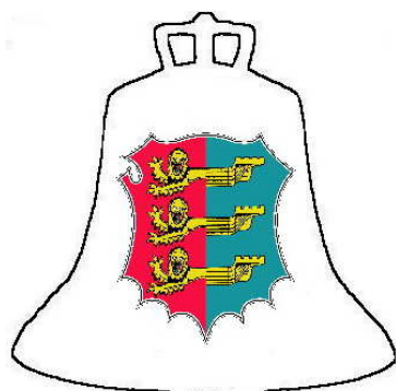
Cinque Ports Ringing Centre at St Mary's, Dover