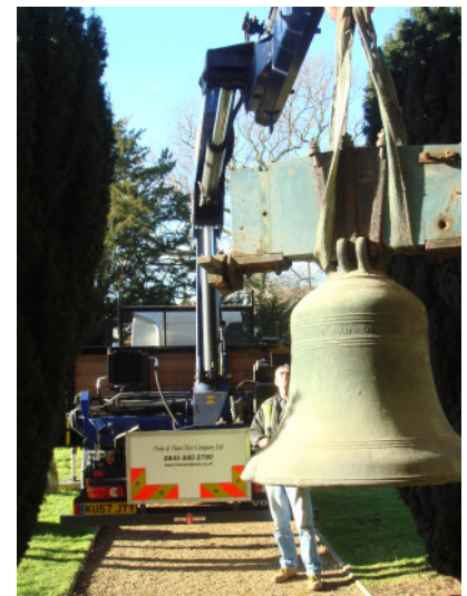
Mereworth Bells are loaded onto the lorry en route to White's of Appleton

Work on the Tower is expected to take about a year (and you know what builders are) but it is possible (fingers crossed) that we can ring our new bells for Christmas and/or New Year 2008/2009.