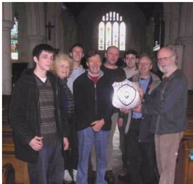
Staplehurst Lads receive the Call Change Competition winners' shield from the judges