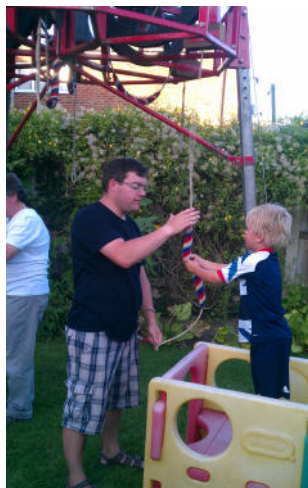
Bottom right: .....but perhaps it's a little better to just take one bell each