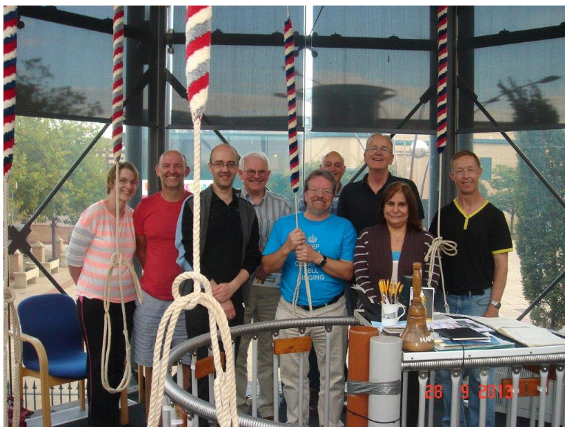
In the glass tower at St Martin's Basildon: