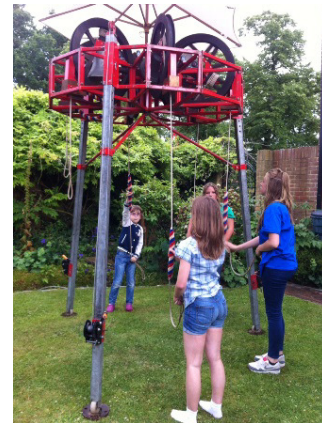
At the District BBQ.