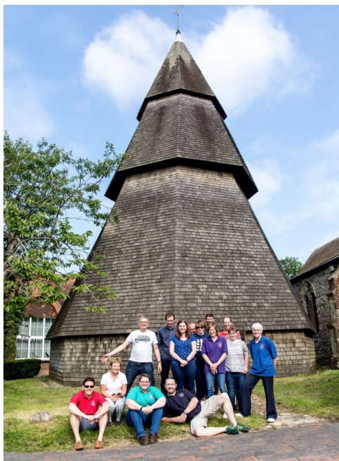
The Edenbridge outing ends at Brookland