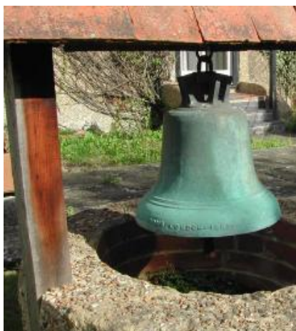
The Brasted bell (Warner's 1887 and rumoured to be ex-Westerham fire station) in its previous rural home