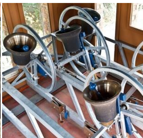
The bells in their new home. The Brasted one is the third and is at the centre on the left, while the antique shop bell (Mears & Stainbank 1905) is the tenor on the far right