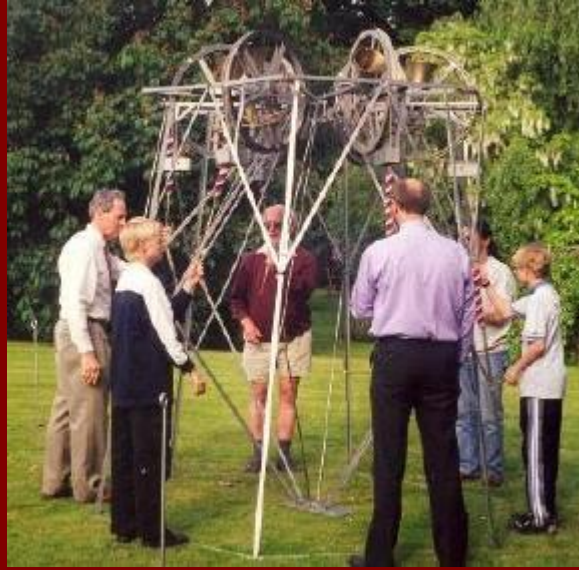
The Jubi Peal in action