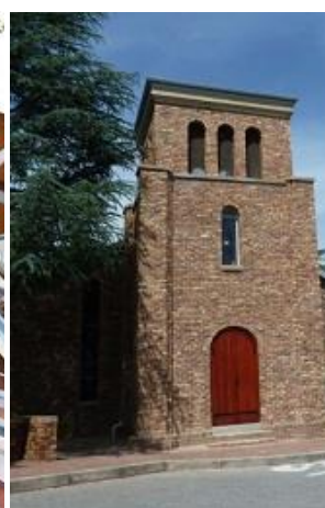
St Peter's College chapel