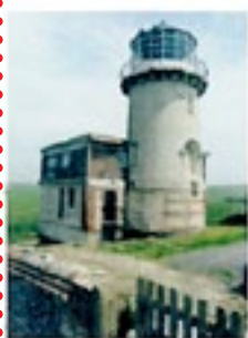
St Vinegary Mirth Burrs Hamlet

IN THE IMMORTAL WORDS of Eric and Ernie, all the letters are there, but not necessarily in the right order. Most (but not actually all) of the odd names and places are anagrams of real people and places in the Tonbridge District (aka ostrich bedding titter or even dotting tetchier birds ). Even the tower photo has a sort of relevance.