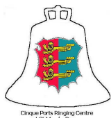
Cinque Ports Ringing Centre at St. Mary's, Dover