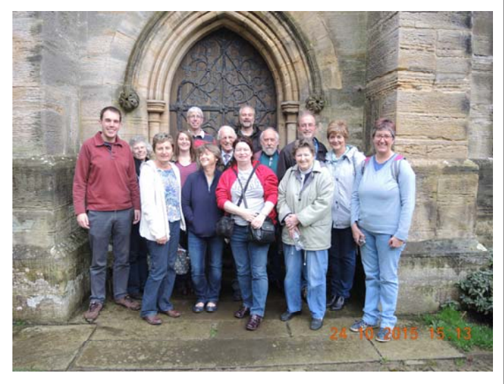
has a vertical iron ladder to the ringing chamber, but a nice ring of 6.

The following weekend we had our annual tower outing to the Kent/Sussex border. Unfortunately we had a lock out at our first tower, but then had a good ring at the 8 bell towers of Wadhurst and Burwash. After a leisurely lunch, we rang at Kilndown, which