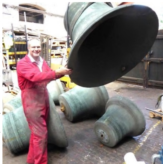
The bells of Southwark Cathedral being measured

http://www.telegraph.co.uk/news/2016/09/06/make-friends-and-find-a-lifelong-passion-through-the-historic-art/