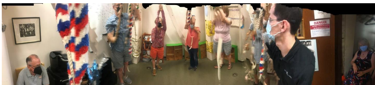
Panoramic view of ringing in the Houston Palmer Tower for the Platinum Jubilee of HRH Queen Elizabeth II.