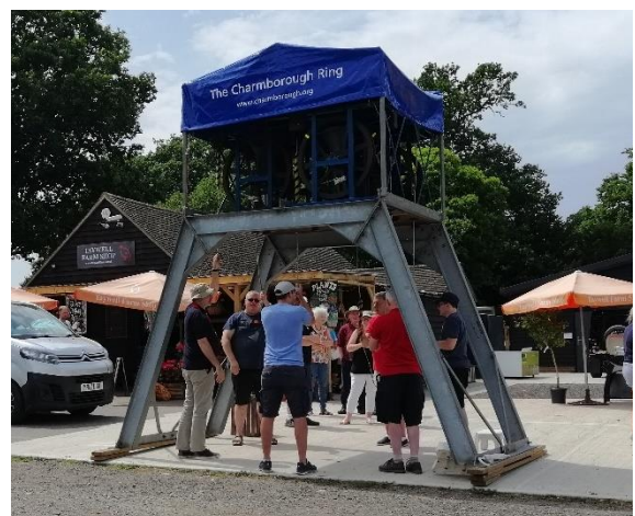
The Charmborough Ring at Taywell Farm Shop