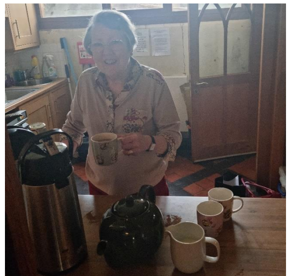
District Tea Lady