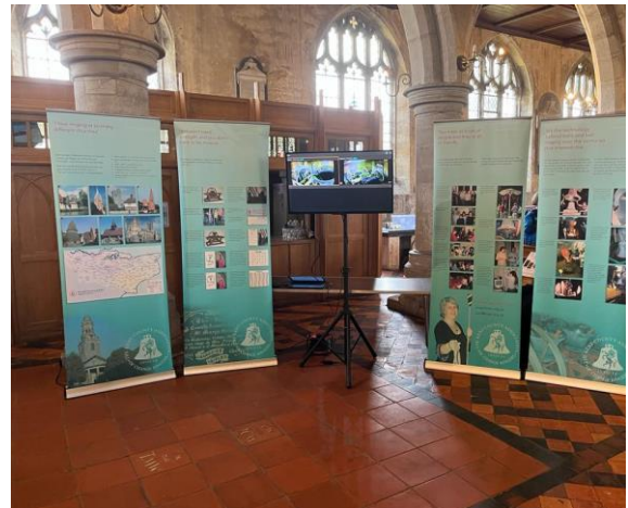
Association promotional material and live streaming