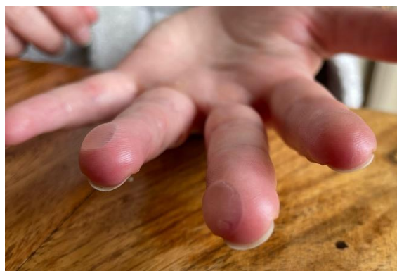
Louise's ET fingers after the peal