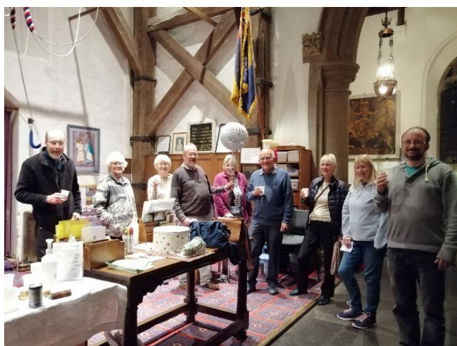
Some of the regulars