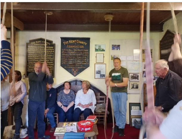
Ringling at Rolvenden

Could it have been a better day out? I don't think so.