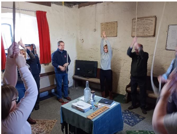
Ringling at Appledore