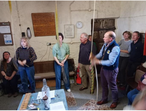
Ringling at Wittersham