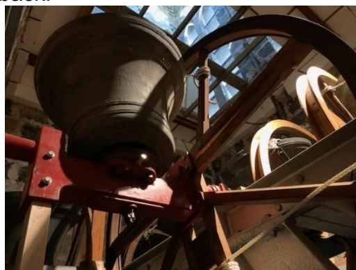
The bells from St Alkmund's, Shrewsbury