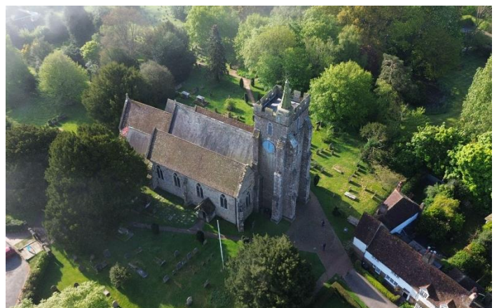
St Mary the Virgin, Rolvenden