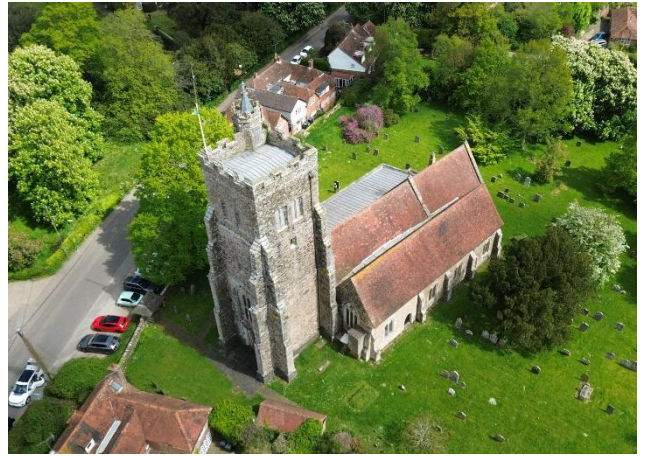
St John the Baptist, Wittersham