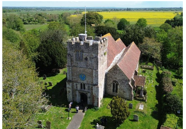
SS Peter and Paul, Appledore