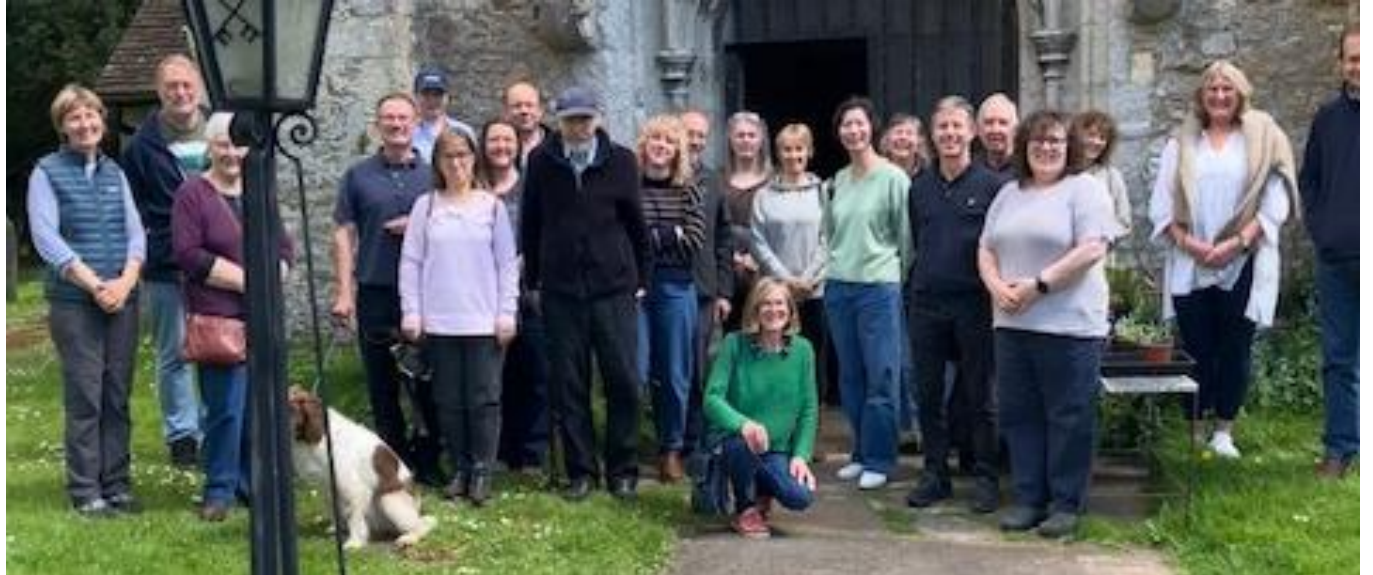
The Outing Party